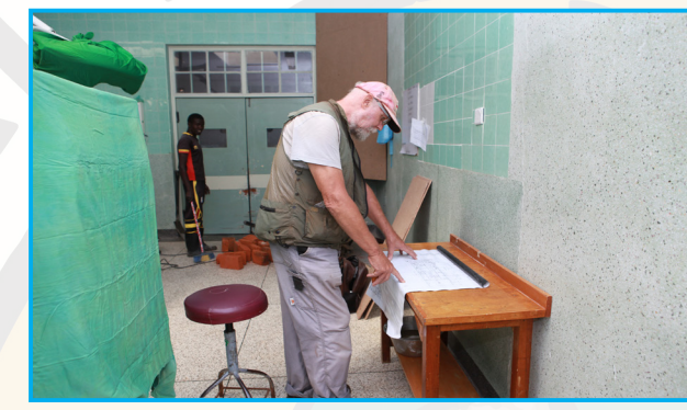
The HEPA Air Renewal System