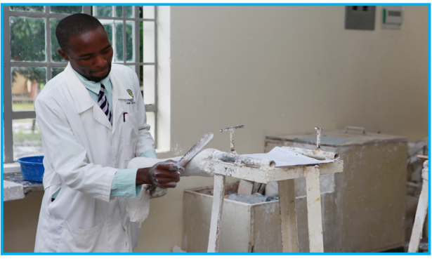
Ankle foor orthosis positive cast modification