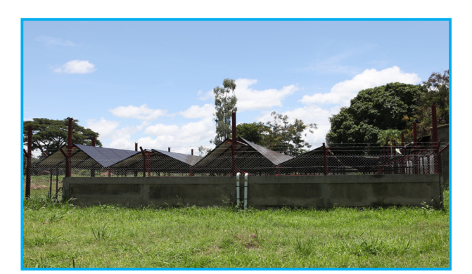
Solar panels at the solar park