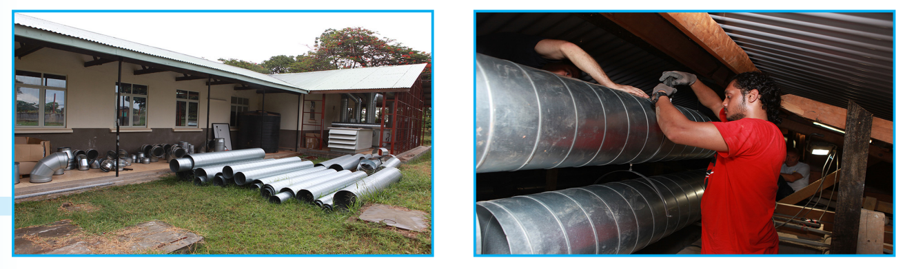
Van Dorp / OC Verhulst took care of the shipping and installation (including materials and technicians).

The Kumi Ongino hospital has received a new air treatment system for the operating theater. Van Dorp Installations, together with its sister company Van Galen Projecten, replaced the installations for the operating rooms of the Flevo-Hospital in Almere. The Flevo-Hospital has made the old insufflation hoods of their operating rooms available. The Orange Climate Group has adapted these and made them suitable for the hospital in Kumi. The installation is complete with air handling units, cooling machine and ducts sent to Uganda. Unfortunately, the Corona virus has thrown a spanner in the works and has delayed transport. In 2023, a team of Van Dorp volunteers assembled and commissioned installations on site. A Solar power installation was also installed to compensate for the extra costs.