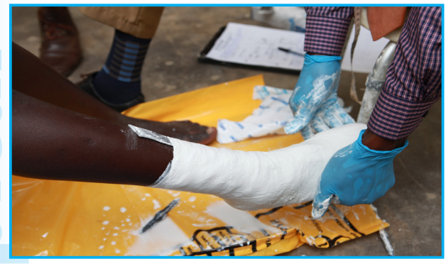
P.O.P. casting (measurements for a foot orthosis)

The International Society of Prosthetics and Orthotics (ISPO) have launched the second International Prosthetics and Orthotics Day on 5th November 2023. This date corresponds to the date ISPO was established in 5th November 1970. International Prosthetics and Orthotics Day is aimed at highlighting and raising awareness of the importance for those needing prostheses and orthoses and the need to provide further resources to ensure equitable and appropriate access to Prosthetic and Orthotic services.